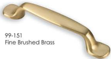
99-151 Fine Brushed Brass