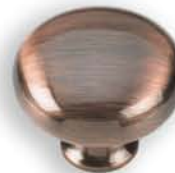
99-197 Fine Brushed Antique Copper