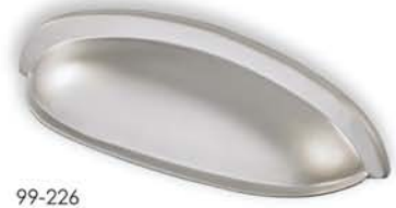
99-226 Matte Nickel