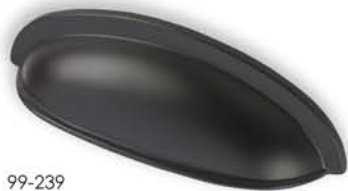
99-239 Oil Rubbed Bronze