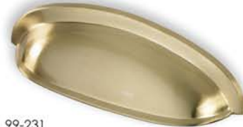
99-231 Fine Brushed Brass