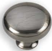
99-189 Fine Brushed Black Nickel