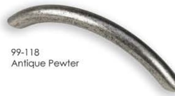
99-118 Antique Pewter