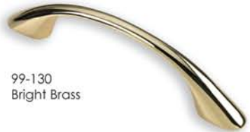
99-130 Bright Brass