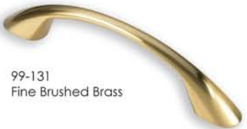
99-131 Fine Brushed Brass