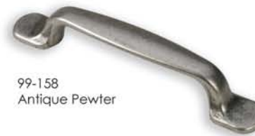
99-158 Antique Pewter