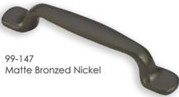
99-147 Matte Bronzed Nickel