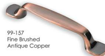
99-157 Fine Brushed Antique Copper