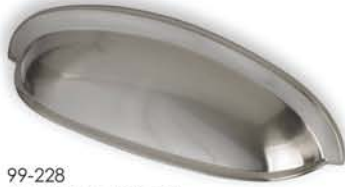
99-228 Fine Brushed Nickel