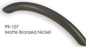
99-107 Matte Bronzed Nickel