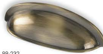
99-232 Fine Brushed Antique Brass