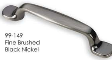
99-149 Fine Brushed Black Nickel