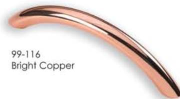
99-116 Bright Copper