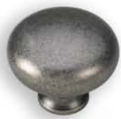
99-198 Antique Pewter