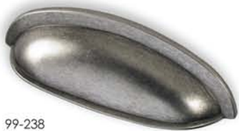
99-238 Antique Pewter