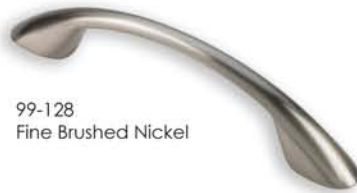
99-128 Fine Brushed Nickel