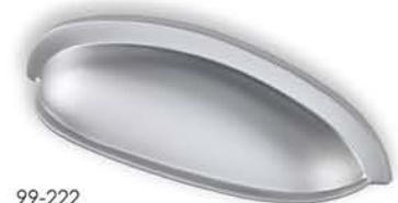
99-222 Matte Chrome