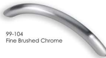
99-104 Fine Brushed Chrome