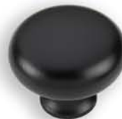
99-194 Matte Black