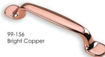
99-156 Bright Copper