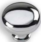
99-180 Bright Chrome