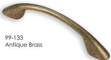
99-133 Antique Brass

OL: 134 mm (5.30") CC: 96 mm (3.75") W: 15 mm (0.60") P: 31 mm (1.20")