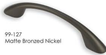
99-127 Matte Bronzed Nickel