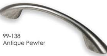
99-138 Antique Pewter