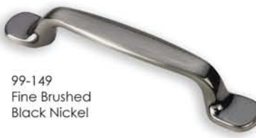
99-149 Fine Brushed Black Nickel