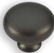
99-199 Oil Rubbed Bronze