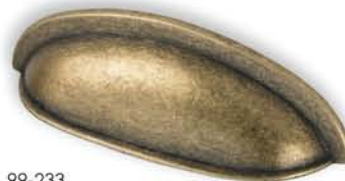
99-233 Antique Brass