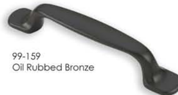
99-159 Oil Rubbed Bronze

OL: 129 mm (5.10") CC: 96 mm (3.75") W: 20 mm (0.80") P: 25 mm (1.00")