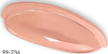
99-236 Bright Copper