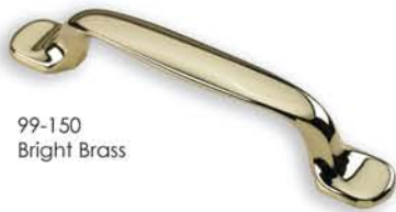
99-150 Bright Brass