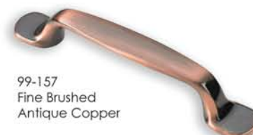
99-157 Fine Brushed Antique Copper