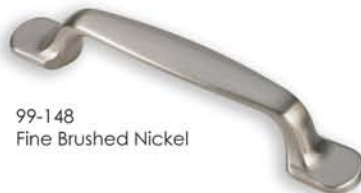
99-148 Fine Brushed Nickel