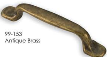
99-153 Antique Brass

OL: 129 mm (5.10") CC: 96 mm (3.75") W: 20 mm (0.80") P: 25 mm (1.00")