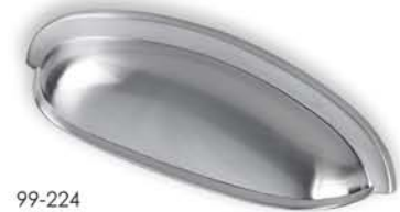
99-224 Fine Brushed Chrome