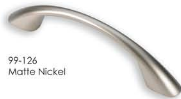
99-126 Matte Nickel