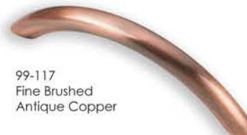
99-117 Fine Brushed Antique Copper