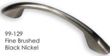
99-129 Fine Brushed Black Nickel