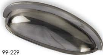
99-229 Fine Brushed Black Nickel