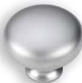
99-182 Matte Chrome