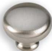
99-188 Fine Brushed Nickel