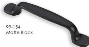
99-154 Matte Black