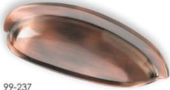
99-237 Fine Brushed Antique Copper