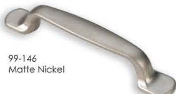
99-146 Matte Nickel