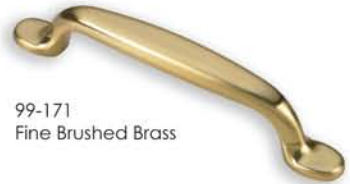
99-171 Fine Brushed Brass