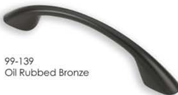
99-139 Oil Rubbed Bronze