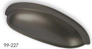
99-227 Matte Bronzed Nickel

OL: 116 mm (4.55") CC: 76 mm (3.00") W: 35 mm (1.40") P: 25 mm (1.00")