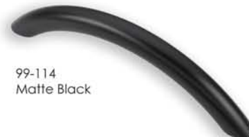
99-114 Matte Black