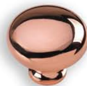
99-196 Bright Copper