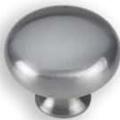
99-184 Fine Brushed Chrome