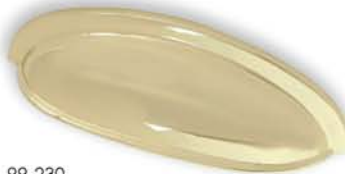
99-230 Bright Brass