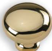
99-190 Bright Brass