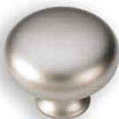
99-186 Matte Nickel