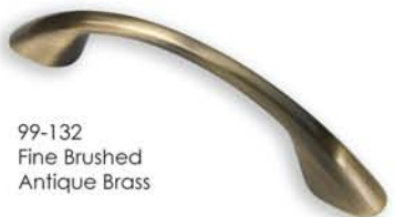
99-132 Fine Brushed Antique Brass