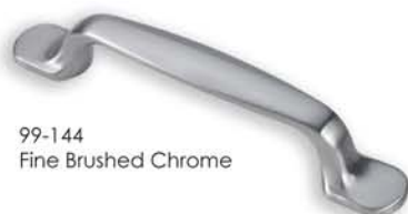
99-144 Fine Brushed Chrome