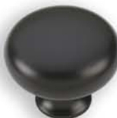
99-187 Matte Bronzed Nickel