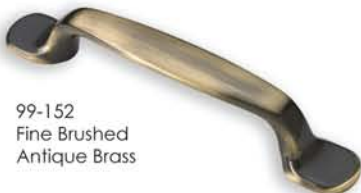
99-152 Fine Brushed Antique Brass