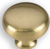
99-191 Fine Brushed Brass