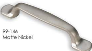
99-146 Matte Nickel