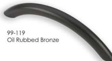
99-119 Oil Rubbed Bronze

OL: 110 mm (4.35") CC: 96 mm (3.75") W: 9 mm (0.35") P: 28 mm (1.10")