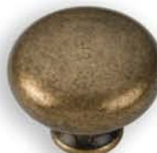
99-193 Antique Brass