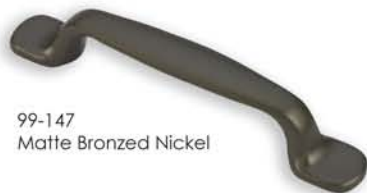
99-147 Matte Bronzed Nickel