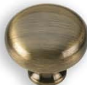
99-192 Fine Brushed Antique Brass